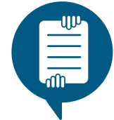
share an article

Read an article or discussion on the iadvisory portal that you think may interest someone? Sharing is now made easy with a link that allows you to email the page to anyone directly.